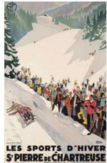
Roger Broders (1883-1953) LES SPORTS D'HIVER A ST. PIERRE DE CHARTREUSE lithograph in colours, 1930, printed by Vaugirard, Paris Estimate: £6,000-8,000